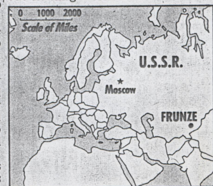
MAP shows city of Frunze, where space alien baby was found.

"We tried everything to save it, but nothing worked ..."